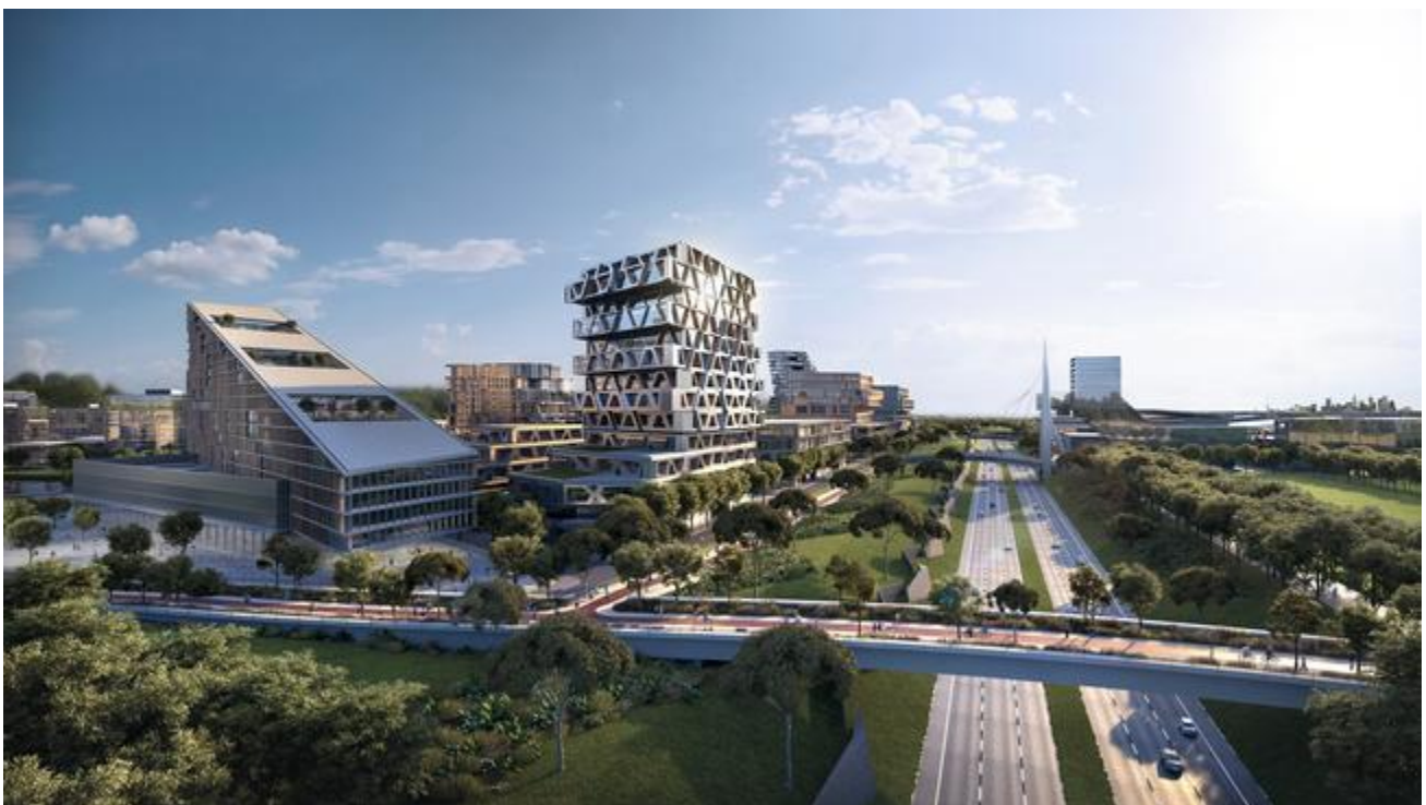
An artist's impression of the Australian Education City.

Another option being considered is a link between the existing Hoppers Crossing train station and the AEC, which could operate with driverless trains.