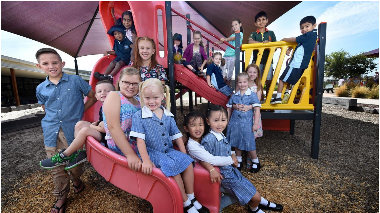
Most homes in Upper Point Cook are zoned for Point Cook P-9 College.