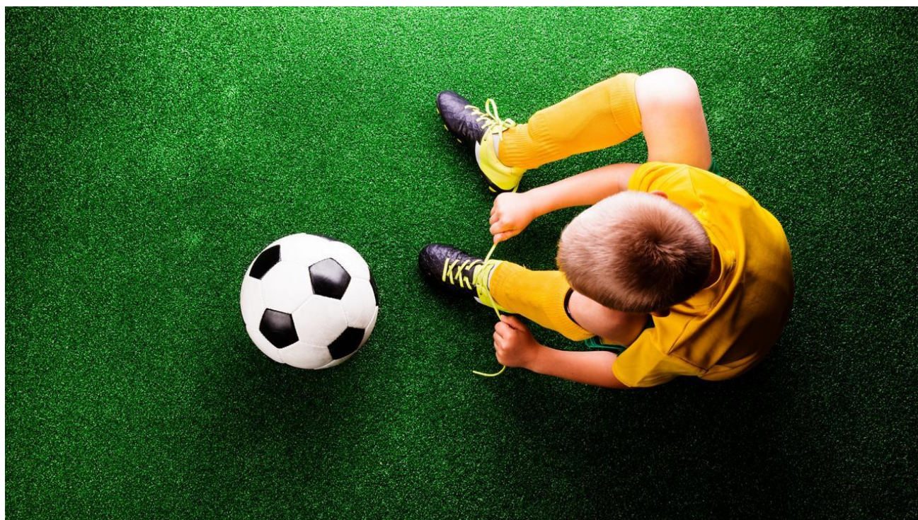
Tom Roberts Parade is home to the West Point Soccer Club.

Both stations are on the Werribee Line and will get you into the city in under 40 minutes.